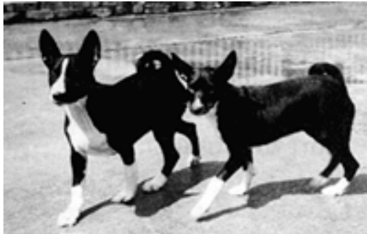
Satin and Sheen of Horsley as puppies in quarantine in England.