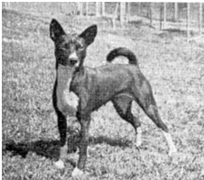
Black Diamond of Cryon.