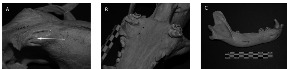
Figure 3. Photographs of a dog crania and mandible collected during the Robert E. Peary expedition in Northwest Greenland in 1897 (specimen #14049, AMNH). A. Healed depression fracture in the left frontal just posterior to the orbit. B. Antemortem loss of the right 4 th premolar and antemortem fracture of the left 4 th premolar. C. Right mandible with 4 th premolar, first molar (carnassial), and 3 rd molar lost antemortem. The antemortem tooth loss and fracture observed in this specimen is consistent with intentional tooth removal to inhibit gnawing. doi:10.1371/journal.pone.0099746.g003

evidence for such practices and behaviors for most of our samples. The Ellesmere dogs were tethered with chains when not pulling sleds, a practice required by law in the 1960s. The percentage of Ellesmere dogs with bite wounds however is similar to that seen in wolves living in this same general region (Table 6). Bogoras [44] mentions that during travel in winter, sled dogs were tethered overnight, but it is not stated whether they were similarly secured during the day. Further, it is unclear which communities he was speaking about, or precisely where he collected the dogs we sampled. Our Chukotka dog sample had some of the lowest rates of bite wounds in the study (Table 6). Overall, no simple correlations between tethering practices and the frequency of bite wounds can be asserted.