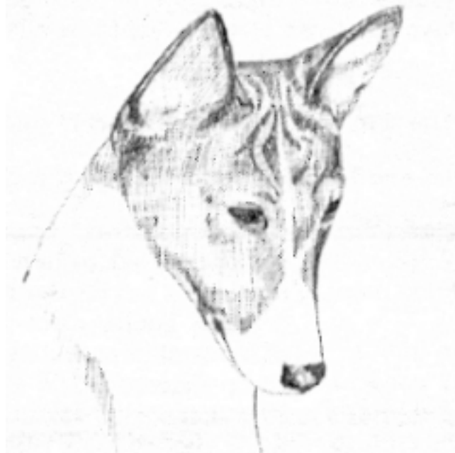
Illustration D: There is little difference between the plane of the forehead and muzzle, it is not filled out, but rather as though the head was pushed in. The muzzle is long.

Illustration E: Cheeky and with large lowset ears which are set far too wide. The eyes are too close set and not quite sufficiently slanting.