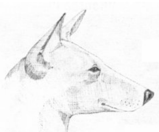
Illustration A: Bull-terrier type head with long muzzle, filled between the eyes and eyes set too high in the head giving a mean appearance.