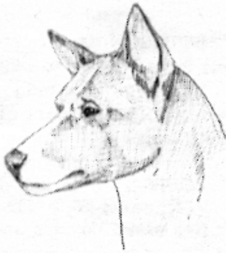
Illustration C: Low-set ears, light nose, long and heavy muzzle with heavy underjaw which is not uncommon in some lines without being undershot. Heavy jowl and neck go together. Nice eye.

This warning doesn't just apply to the States. We are getting some bull-terrier type heads in Britain; Australia is getting light eyes and a few long muzzles. We are all losing wrinkle. Perhaps this well meant warning will make people take a long clear look at their dogs and see faults in them which they had not noticed. These faults can be bred out.