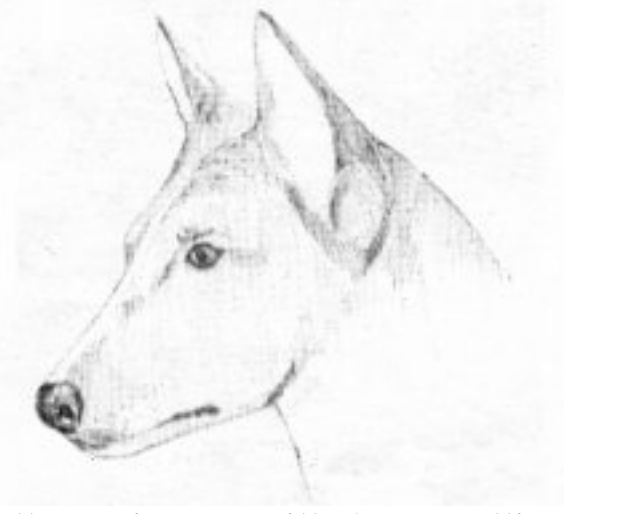
Illustration B: Filled out collie type head with long muzzle and a light eye.

Illustration A: Bull-terrier type head with long muzzle, filled between the eyes and eyes set too high in the head giving a mean appearance.