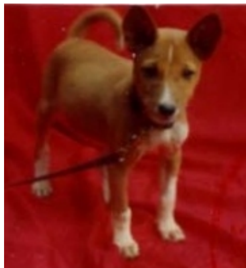
Honey's passport photo.

Honey's temperament is attentive and loving to "her" family/pack. She is gradually learning to expand her