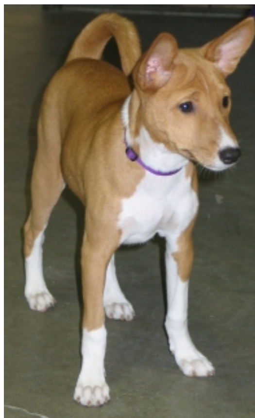
Honey at the 2004 BCOA National.